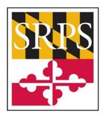
MARYLAND STATE RETIREMENT and PENSION SYSTEM

TECHNICAL ASSISTANT AND SYSTEM DEVELOPMENT INTERN